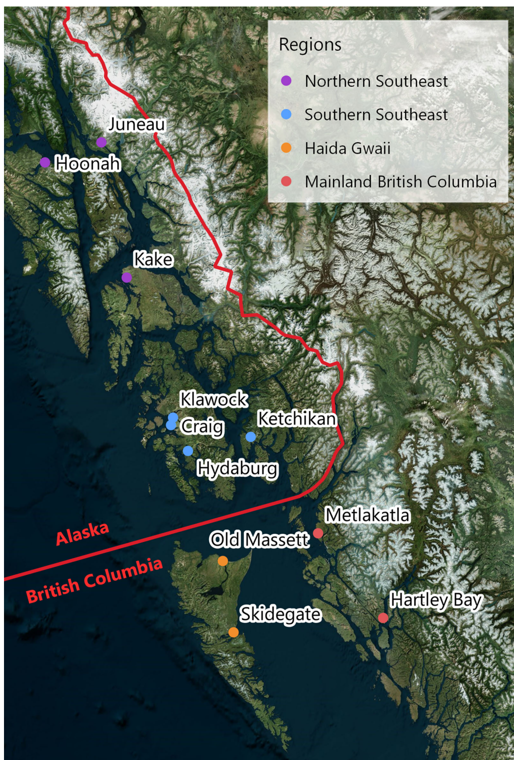
Fig. 1 Map of communities visited during this fieldwork on the coast of British Columbia, Canada, and Alaska, United States of America, and showing the four subregions linked to the climatic and geographical zones.

Metlakatla, Hartley Bay, Skidegate, and Old Massett, British Columbia (Fig. 1). Interviewees consisted of long-term residents either of one of the three main coastal