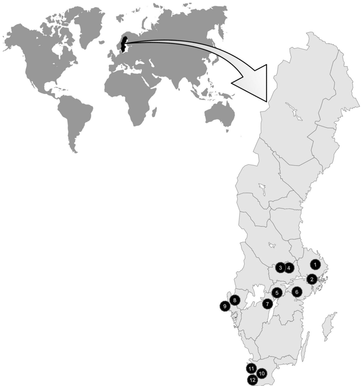
Fig. 1 Map of Sweden showing geographical positions of the edible forest gardens in the study

shade in hot and sunny climates, might not be useful when sunlight is a critical factor in intercropping systems. Especially in locations as Sweden, where the majority of the landscape is used to produce timber. It might be better for the tree layer to be lower, including smaller or coppiced trees that provide edible fruits, berries, leaves and possible nitrogen